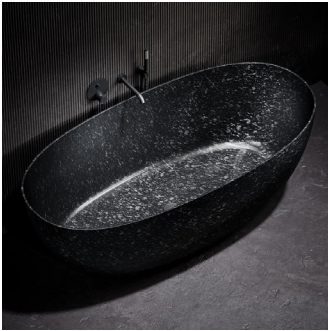
CARBON FIBRE LIFETIME