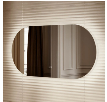
MIRRORS 10 YEARS