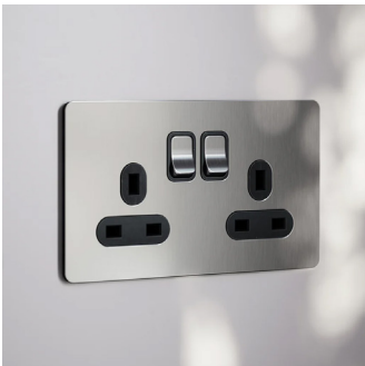
ELECTRICAL 2 YEARS