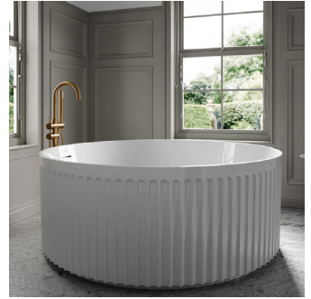
ACRYLIC 15 YEARS