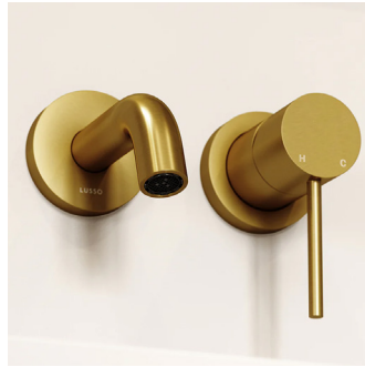
BRASSWARE 15 YEARS