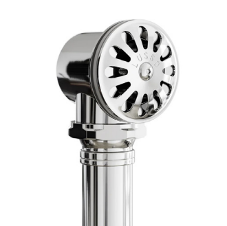
WASTE SYSTEMS 20 YEARS