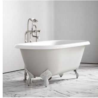
CAST IRON LIFETIME