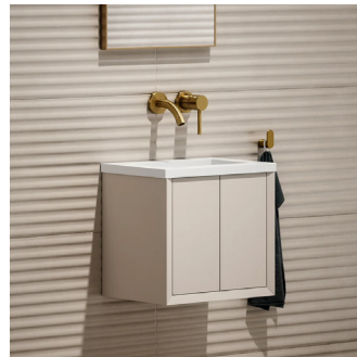
WOOD 7 YEARS